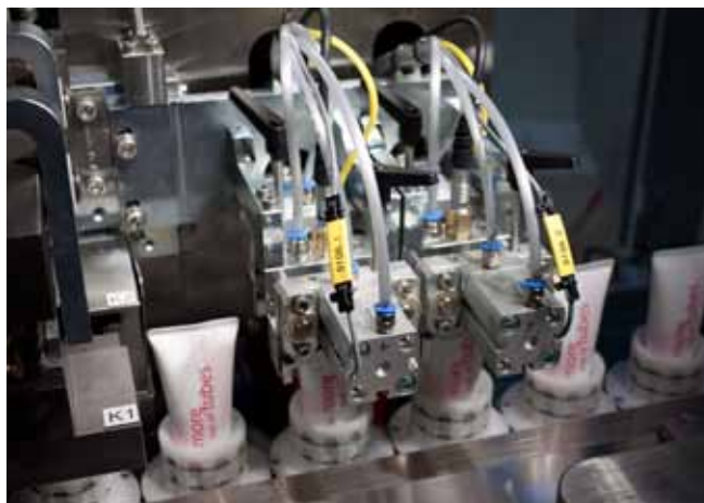
In-line leak testing of tubes with Sensistor ISH2000 HySpeed

For the leak testing of tubes, the system is marketed exclusively by Norden Machinery, a world-leading supplier of tube-filling systems.