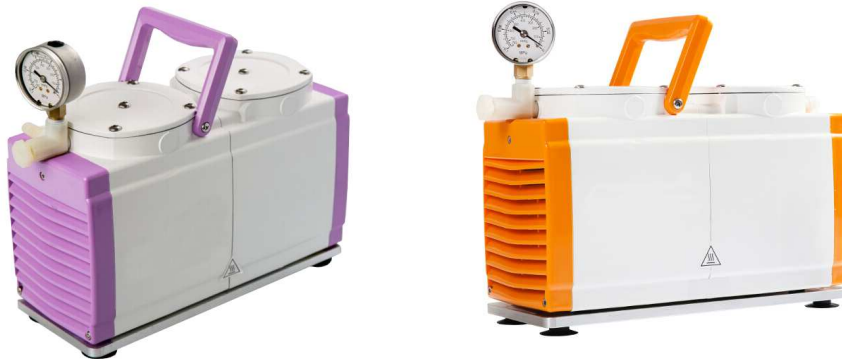
Pumpdown time for 10 ltr vessel