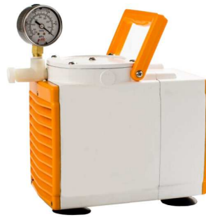
Pumpdown time for 10 ltr vessel